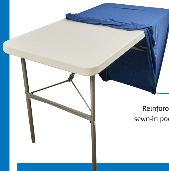
Reinforced sewn-in pockets