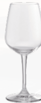
14069 13 oz. All Purpose Wine H 8" | D 3 1/4" 2 doz.