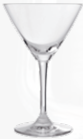
14064 7.25 oz. Cocktail H 6 3/8" | D 4" 2 doz.