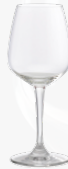
14066 11 oz. All-Purpose Wine H 7 5/8" | D 3 1/8" 2 doz.