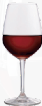
14065 16 oz. All-Purpose Wine H 8 1/2" | D 3 3/8" 2 doz.