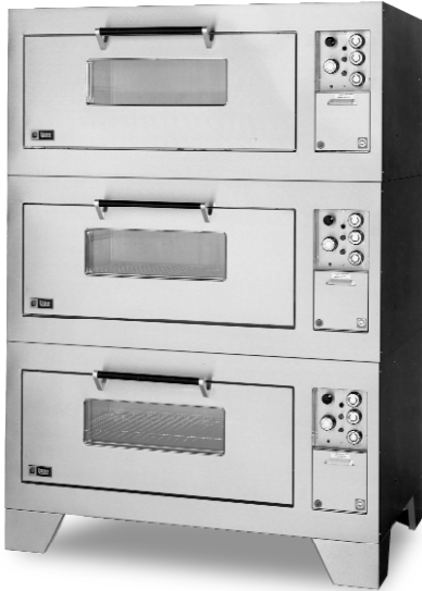
Model D054R3 shown