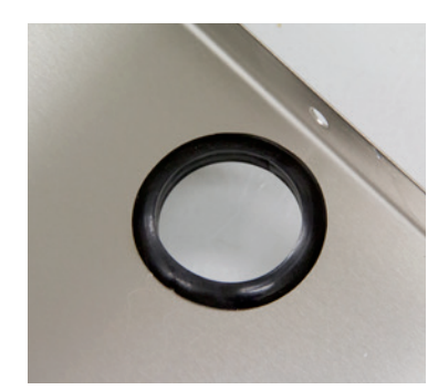
ELECTRIC CORD CUT-OUT WITH RUB-BER GROMMET