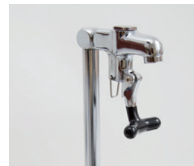
Optional Glass Filler Faucet