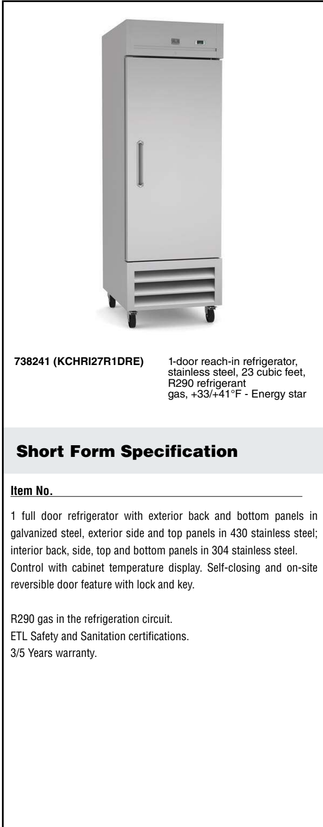
738241 (KCHRI27R1DRE) 1-door reach-in refrigerator, stainless steel, 23 cubic feet, R290 refrigerant gas, +33/+41 °F - Energy star