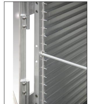
Heavy Duty Hinges