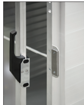
Magnetic Door Latch