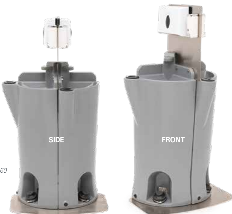
Model #69960 12-gallon