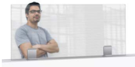
Avant Garde™ 48" Polycarbonate Tabletop Divider 48 x 3 x 20 in Item #TD010 Includes Stainless Steel Brackets