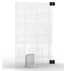
Avant Garde™ 18" Polycarbonate Tabletop Divider 18 x 3 x 20 in Item #TD012 Includes Stainless Steel Brackets and Cross Connectors