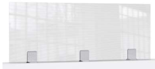
Avant Garde™ 60" Polycarbonate Tabletop Divider 60 x 3 x 20 in Item #TD011 Includes Stainless Steel Brackets