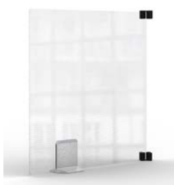
Avant Garde™ 24" Polycarbonate Tabletop Divider 24 x 3 x 20 in Item #TD013 Includes Stainless Steel Brackets and Cross Connectors