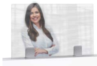
Avant Garde™ 36" Polycarbonate Tabletop Divider 36 x 3 x 20 in Item #TD008 Includes Stainless Steel Brackets