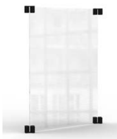
Avant Garde™ 18" Polycarbonate Tabletop Divider 18x 0.16 x 20 in Item #TD014 Includes Cross Connectors