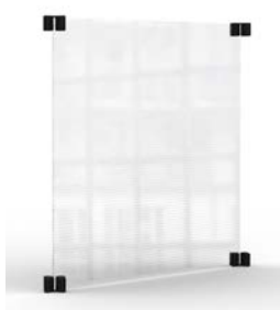
Avant Garde™ 24" Polycarbonate Tabletop Divider 24 x 0.16 x 20 in Item #TD015 Includes Cross Connectors