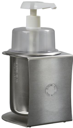
CHS-1-DCHP (countertop application)