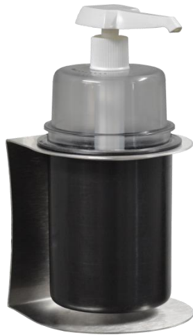
CHS-1-PCBLACK-DCHP (shown in wall-mount application)