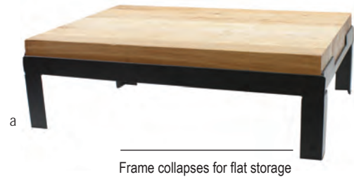
Frame collapses for flat storage