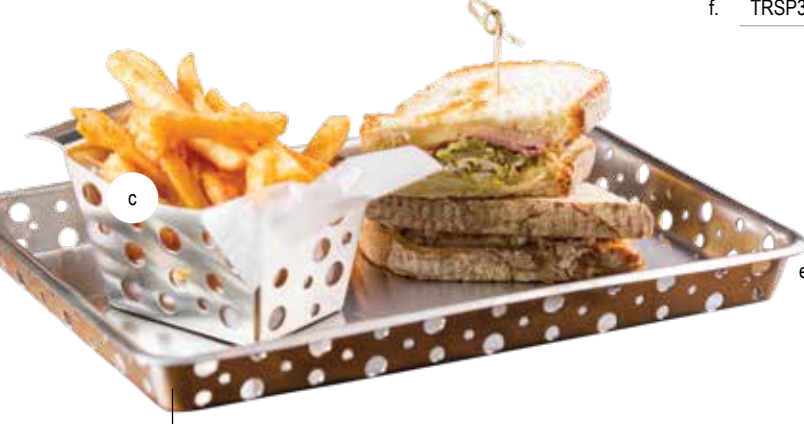
This cut-out, stamped design comes full circle! Coordinate your service with trays, side baskets and taco taxis into one totally-hole presentation