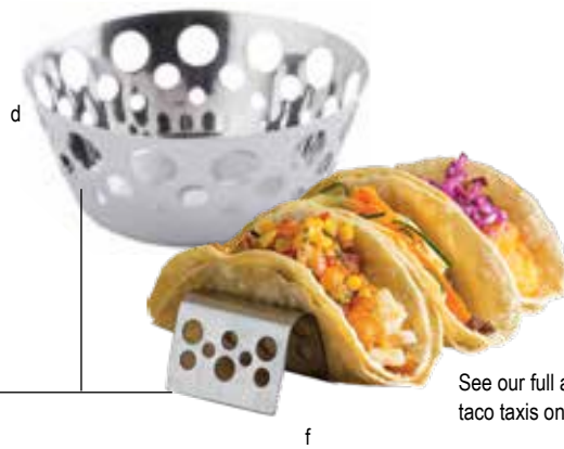
See our full assortment of taco taxis on page 173