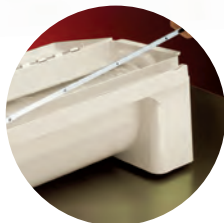
safety blade removes for loading & cleanup