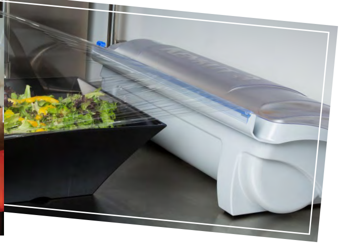
Wall mounting option