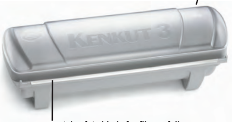
metal safety blade for film or foil