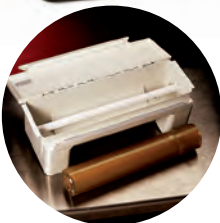
dowel rod standard

Product support or video training visit: www.kenkut.com