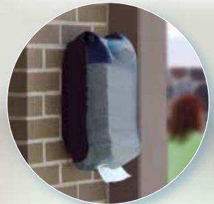
△ SPACE-SAVING WALL MODEL